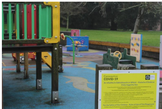
These Times - Rhian O Callaghan

The photos included in this newsletter were created by 5 th Year students in response to Weekly Challenges set in English class through the last lockdown.